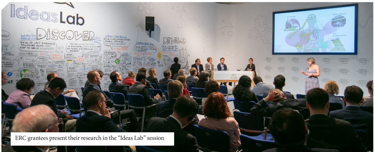
ERC grantees present their research in the “Ideas Lab” session